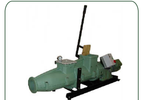
Venco 87mm (3.5") de-airing pugmill * stainless steel auger standard * high capacity motor and gearbox * 800lb/hr output