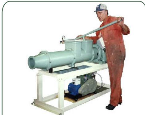
Venco HIGH CAPACITY pugmills * All stainless steel construction * up to 4200 lb/hr, variable speed